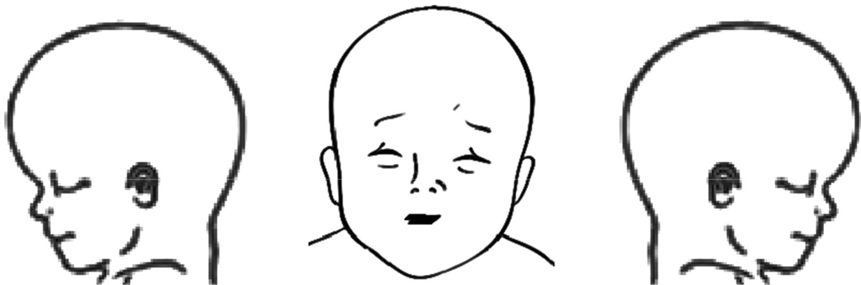
Figure 2 Data sheet: instrument markings on neonatal head and face.

Placement of instruments: Optimal Suboptimal