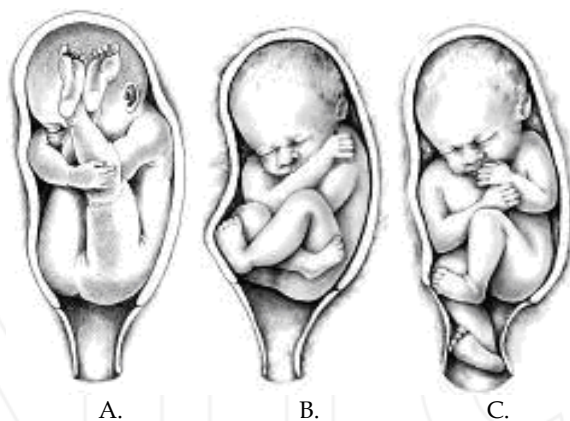
Fig. 1. A. Frank breech (65-70%) The baby's legs are flexed at the hip, his or her knees are extended and feet next to the head. This is the most common type in pregnancies at term. B. Complete breech (5%) In this case, the baby's hips and knees are flexed. The fetus positions is the same as in the vertex presentation but, in this case, the polarity is reversed. C. Incomplete breech (~30%) The baby has one or both knees flexed so that baby's legs (not his or her bottom) are poised to deliver first. This type is common in preterm deliveries.

From the etiologic point of view, the breech presentation could be caused by situations avoiding or hampering the spontaneous cephalic version.