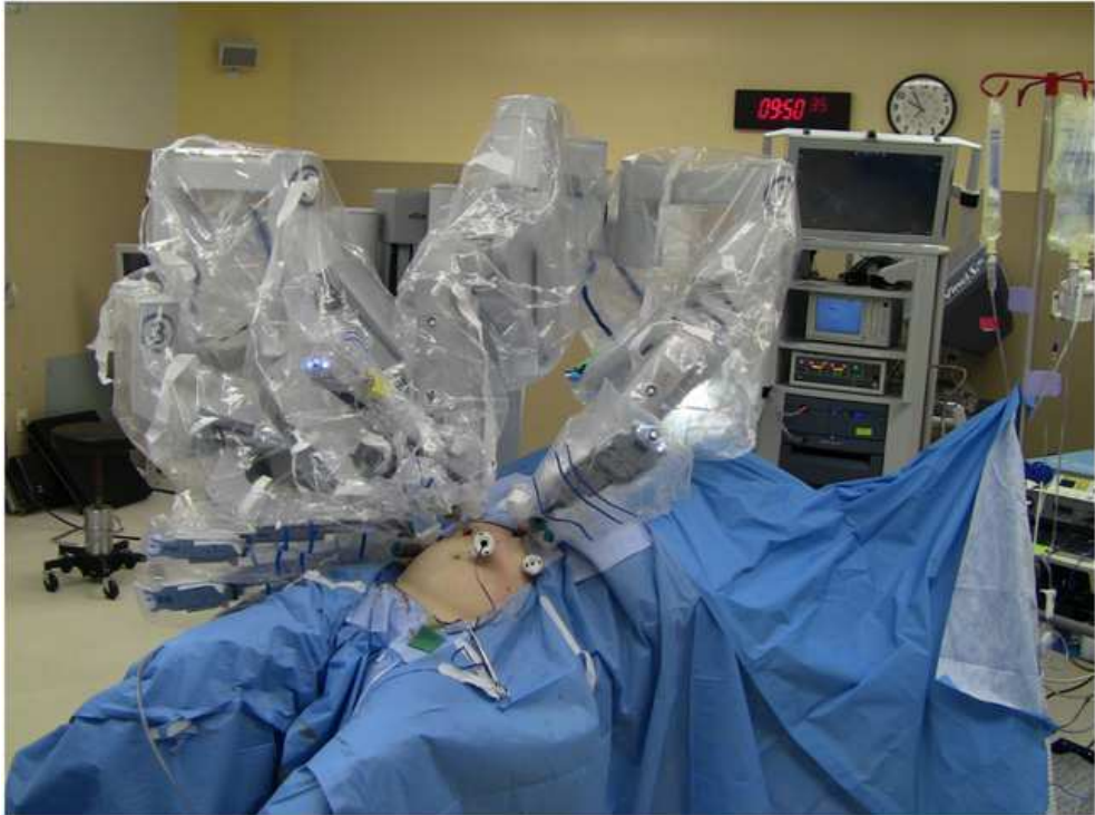
Fig. 2. Robotic platform docked off patient's right shoulder in 10 degree reverse Trendelenburg position, and 10 degree rotation to left.

It has been demonstrated that minimally invasive surgery is associated with less blood loss, shorter hospital stay, less post operative pain, improved cosmesis, and faster recovery compared to traditional approaches (32), (33). 10 cases were reported with an operative time of 207 minutes, blood loss of 355 cc and nodal yield of 27 (34). It was observed that the operative time in robotic radical hysterectomy was 241 minutes and blood loss of 71 cc, and no conversion to laparotomy reported (35).