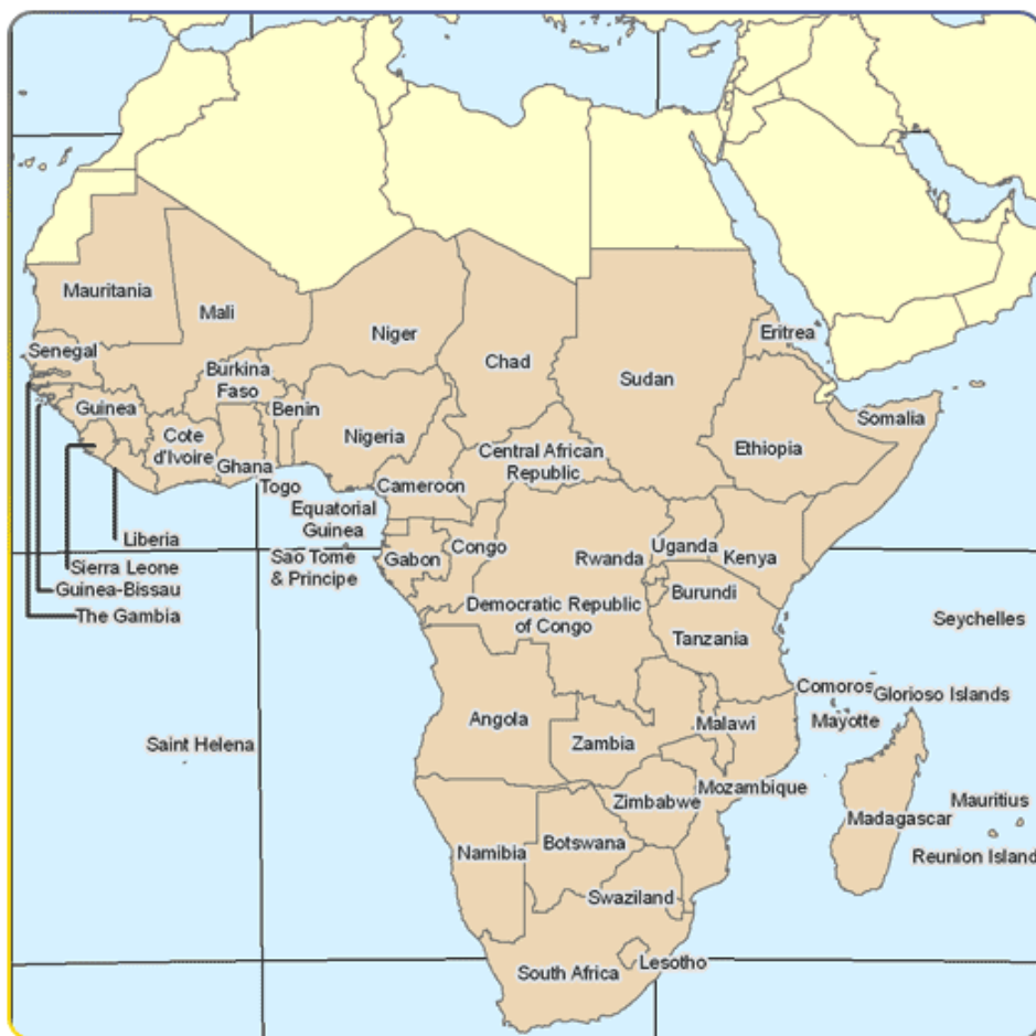
Fig. 1. Map showing the countries of Sub Sahara Africa (NB Southern Sudan became independent July 2011)

hospital and regional based cancer registry figures, reports from specific centres, conference proceedings and a review of work done on cervical cancer in the authors institution The University College Hospital Ibadan Nigeria.