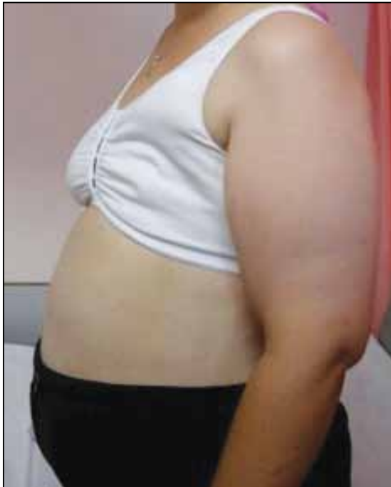
Figure 1 A pregnant woman with mastectomy

In terms of pregnancy outcomes for the WA study, 175 subsequent pregnancies were confirmed from 123 women previously diagnosed with breast cancer. Over one-third of the