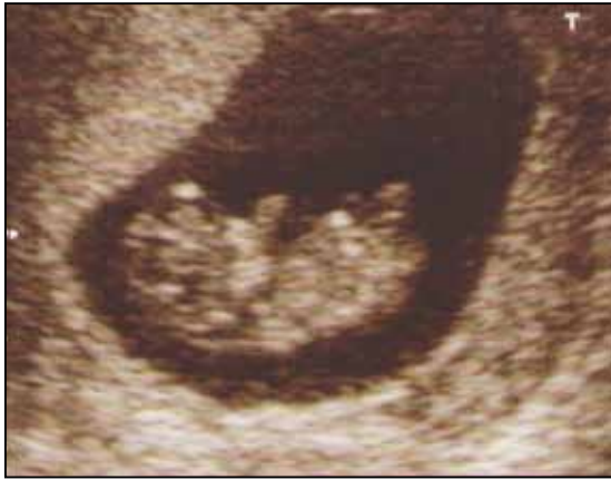
Figure 2 Fetal ultrasound